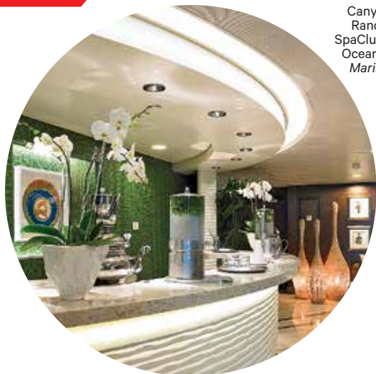
Canyon Ranch SpaClub, on Oceania's Marina