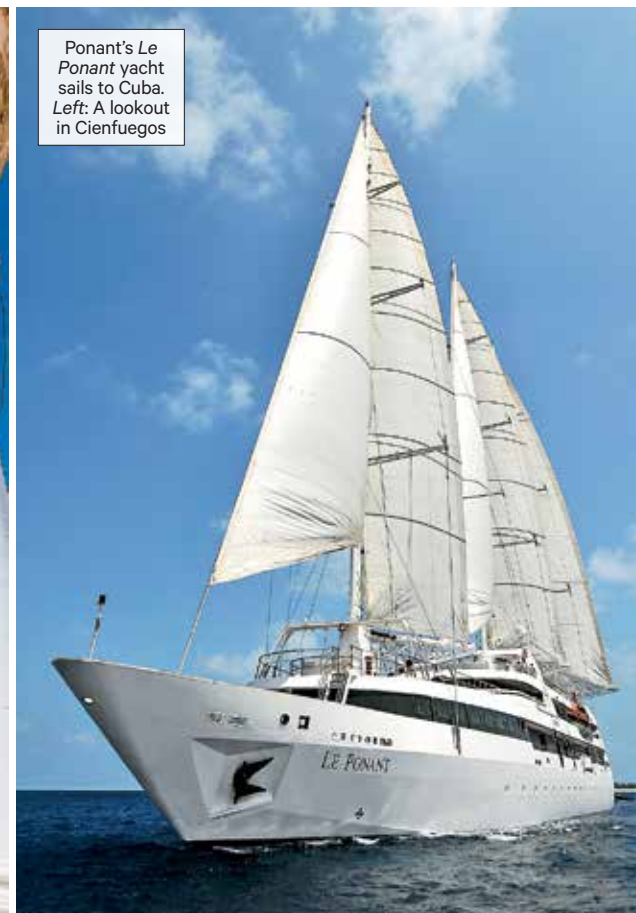
Ponant’s Le Ponant yacht sails to Cuba. Left: A lookout in Cienfuegos