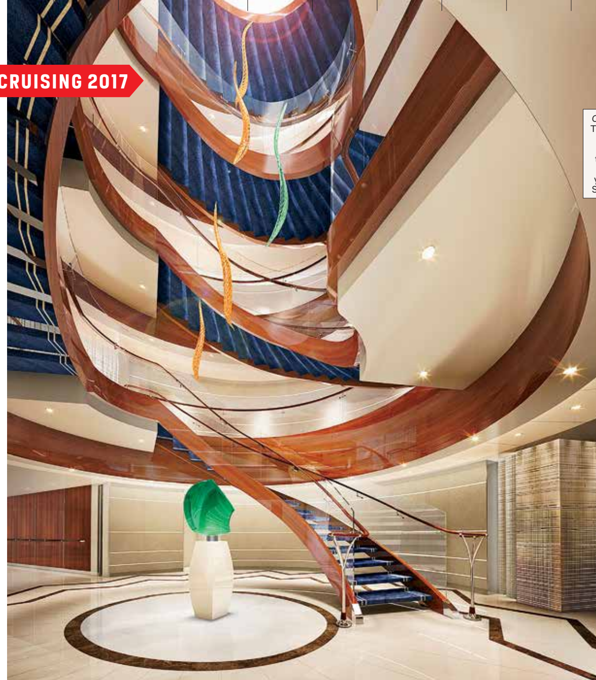
Clockwise from left: The atrium entrance on the Seabourn Encore ; one of three pools on the Viking Star ; the yacht-like Veranda Suite on the Encore