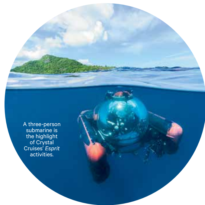
A three-person submarine is the highlight of Crystal Cruises’ Esprit activities.

Personal submarines, scuba diving, and more turn cruising into an active adventure.