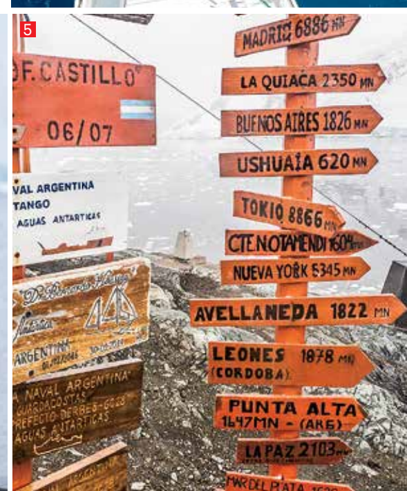
1 Chinstrap penguins 2 The Australis cruising the Melchior Islands 3 A humpback whale in Paradise Bay 4 Two more in Dallmann Bay 5 Signs at Base Brown, an Argentinean coast guard site near Paradise Bay 6 Two gentoo penguins watch the Australis in Paradise Bay 7 A visitor photographs an ice cave 8 Camping on an ocean-bound rock near Enterprise Island. A National Science Foundation permit allows Natural Habitat Adventures guides and clients to camp in spectacular spots.